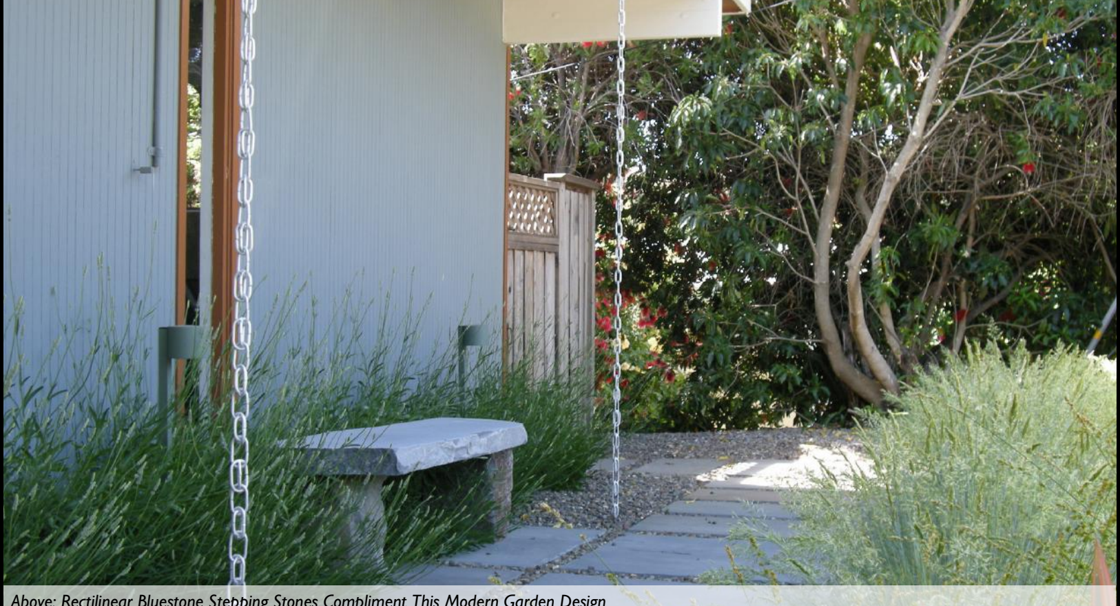
Above: Rectilinear Bluestone Stepping Stones Compliment This Modern Garden Design